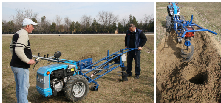
Fig. 2. Motocultivator – Soil drilling equipment BM - general view

Next, the case is studied where the drilling equipment is carried and powered by a 19 HP motocultivator and equipped with a 300 mm auger diameter, the drilling depth and speed are adjusted by the operator in accordance to the soil type, if the soil is compacted, the drilling procedure is sequential or a dedicated auger is chosen, see Fig. 1 and 2.